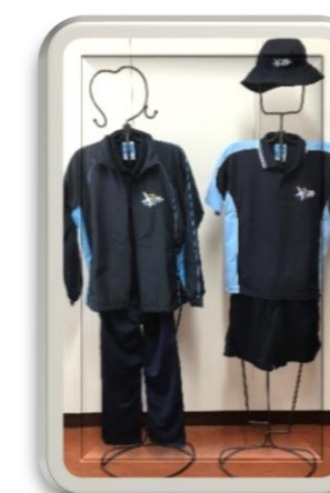
Sports Uniform (Unisex)